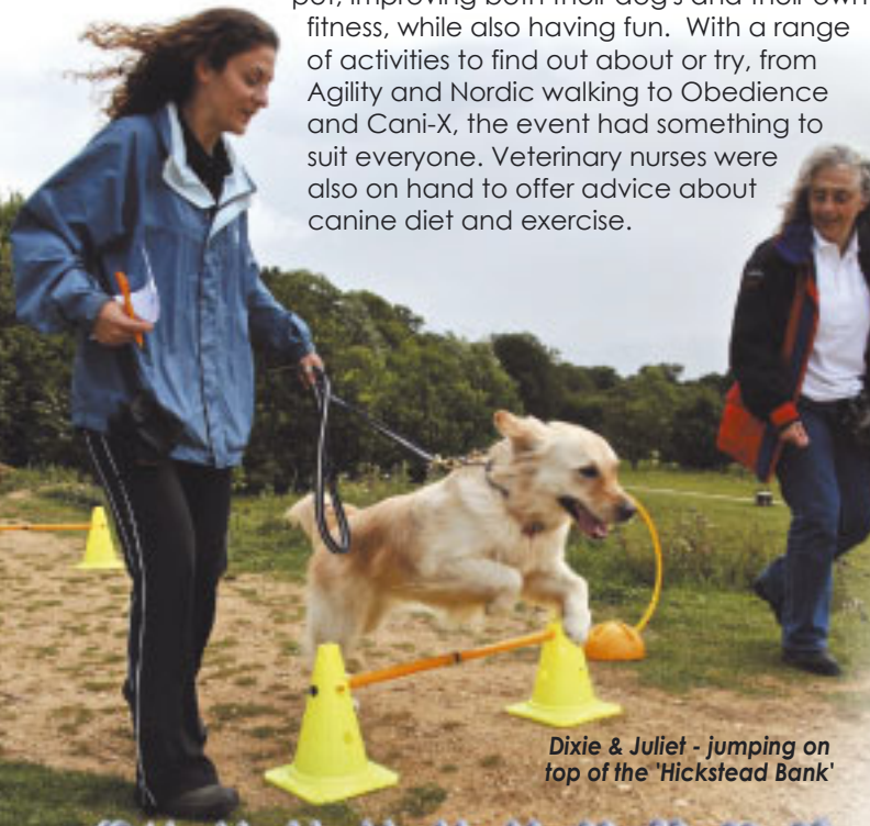
Dixie & Juliet - jumping on top of the 'Hickstead Bank'

A fun day was held at Hinchingsbrooke Country Park for families and their dogs. Healthy Dog, Healthy You! aimed to show dog owners the many exciting ways they can exercise with their pet, improving both their dog's and their own fitness, while also having fun. With a range of activities to find out about or try, from Agility and Nordic walking to Obedience and Cani-X, the event had something to suit everyone. Veterinary nurses were also on hand to offer advice about canine diet and exercise.